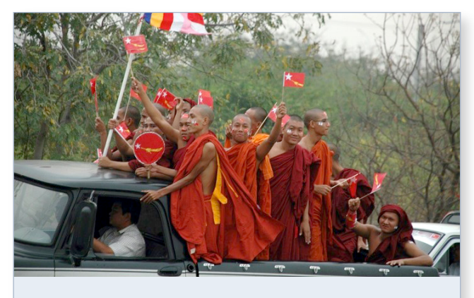
Buddhist monks advocating for democracy near Mandalay, Burma. Religion plays a key organizing role in some parts of the world, serving as an important source of legitimacy and authority.

Consistent with the growing salience of established identities, religion continues to play important roles in people's lives, shaping what they believe, whom they trust, with whom they congregate, and how they engage publicly. In developing regions where populations are growing fastest, including Africa, South Asia,