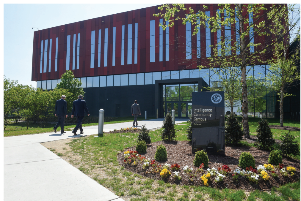
The Intelligence Community Campus in Bethesda, Maryland (ICC-Bethesda). The ICIG maintains a satellite office at ICC-B.

OGC continues to review and monitor proposed legislation and regulations potentially affecting ICIG operations specifically and the broader Inspector General community generally. Further, OGC regularly engages with congressional staff to discuss pending and potential legislation. For example, OGC closely tracked and commented on the House and Senate Intelligence Authorization Acts of 2018 and 2019, and discussed with staff the need for legislation aimed at enhancing the ICIG's ability to recruit and retain experienced investigators.