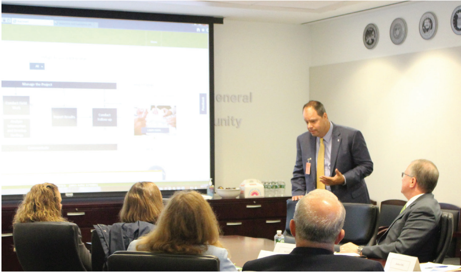
A CIGIE Training Institute staff member discusses an online tool and methodology currently under development.

from several OIG I&E offices are consulting on its development. Committee members generally agreed that the I&E Navigator, scheduled to be completed in late FY 2019, has the potential to be a helpful tool for inspectors in accomplishing their I&E oversight mission. CIGIE anticipates developing similar tools for investigations, audits, and OIG leadership.