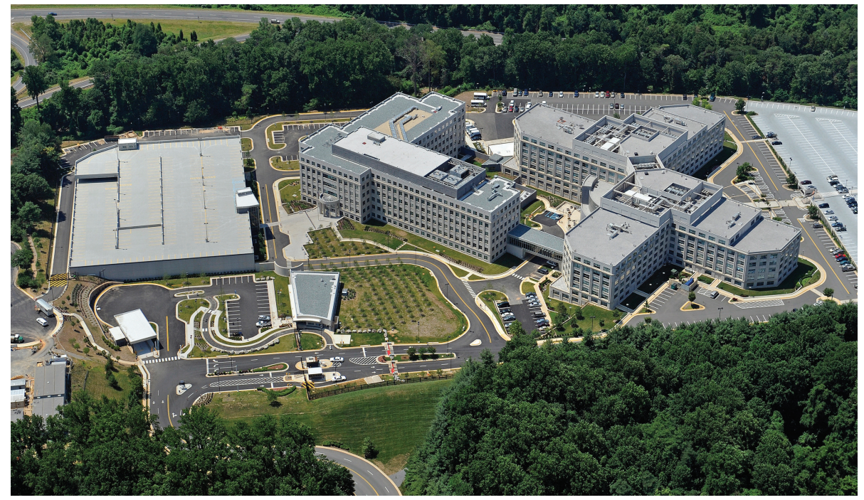
The ICIG maintains a satellite office at ODNI's headquarters at Liberty Crossing.

The Investigations Division has begun to work with ODNI and the other IC elements and stakeholders to develop a program to meet the ICIG's obligations under ICD 701. The Investigations Division will begin to implement this new program during the next reporting period.