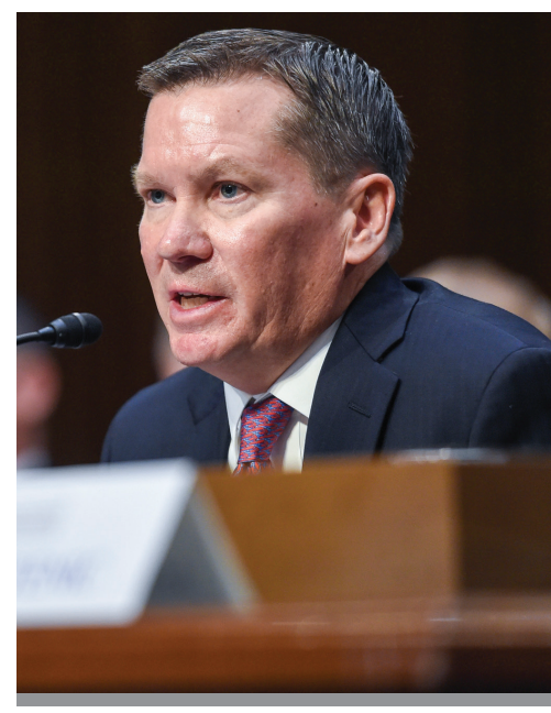
Michael K. Atkinson testifies during an open hearing for his nomination as the Inspector General of the Intelligence Community before the U.S. Senate Select Committee on Intelligence on January 17, 2018.

During the reporting period, the ICIG also acted to enhance the transparency of its activities. By streamlining its procedures and hiring critical personnel, the ICIG completed 80 percent of its own FOIA cases, which significantly reduced its FOIA backlog; these improved procedures should reduce future case processing times by at least half. In addition, the ICIG for the first time in its history issued an ODNI management