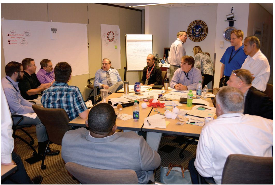
Intelligence Community IT professionals collaborate to discuss identity, credentials, and access management (ICAM) requirements to produce a community-wide ICAM reference architecture at an offsite held at ODNI.

The ICIG Audit Division and the National Reconnaissance Office OIG co-hosted the second Intelligence Community Information Technology Auditor Summit. The summit featured the IC Chief Information Officer's insight on strategies and challenges in IT developments for the IC. Speakers from across the community shared information on current topics including the use of data analytics for IT audits, privacy controls in the IC, and mitigating security and counterintelligence risks in the IT supply chain. Roundtable discussions provided participants the opportunity to share ideas on approaches and best practices, and to discuss challenges in conducting IT audits.