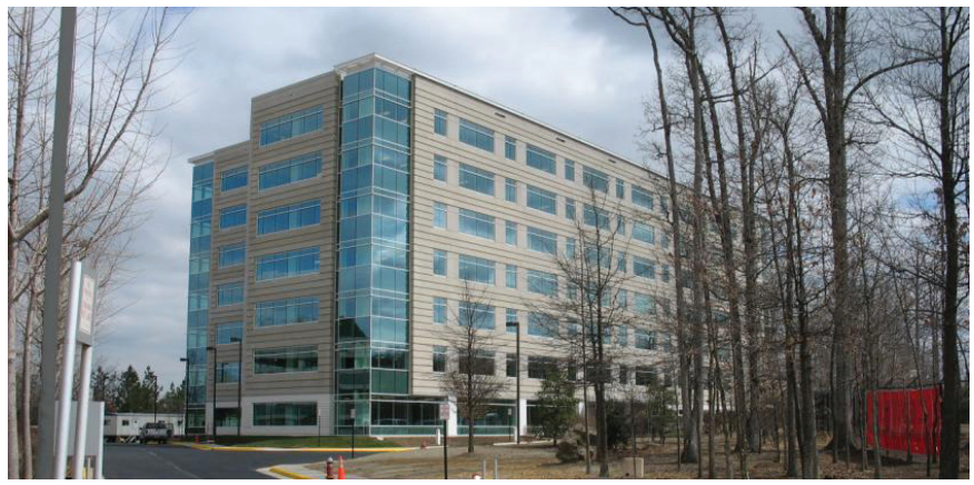
The ICIG's main offices are located at 12290 Sunrise Valley Drive, Gate 3, Reston, VA 20191.

Finally, as always, I sincerely thank the employees and contractors at the ICIG for their integrity, hard work, and commitment to the ICIG's mission.