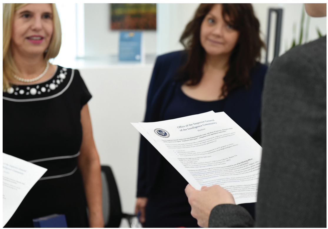
ICIG staff sensitize IC employees about reporting obligations during a National Compliance Officer Day observance in September.

personnel through various elements of the IC in an effort to foster a broader community perspective, and to provide IC civilian joint duty qualifying experience(s) to those civilian personnel in the course of their careers. Preliminary discussions with the Deputy Inspectors General of the other Forum members have begun. The Committee anticipates addressing this topic at their next meeting in the first quarter of FY 2019, and providing their work for consideration by the Inspectors General at a future Forum session.