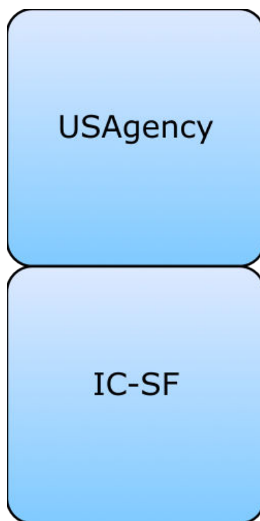
Figure 1 : Related Specifications