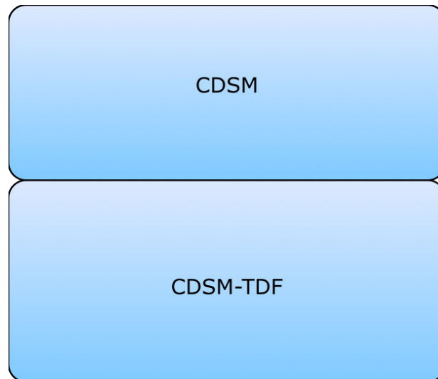
Figure 2 : Inverse Dependency Specifications

For specifications that are used as assertions by some TDF specification, the inverse dependency specification diagram, Figure 2 , will only show the TDF specifications that are typically used with this specification and will not show all TDF specifications that can use it.