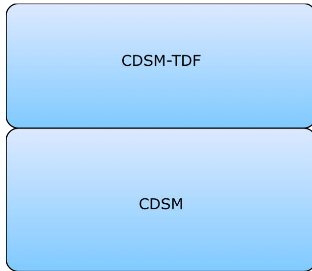
Figure 2 : Inverse Dependency Specifications