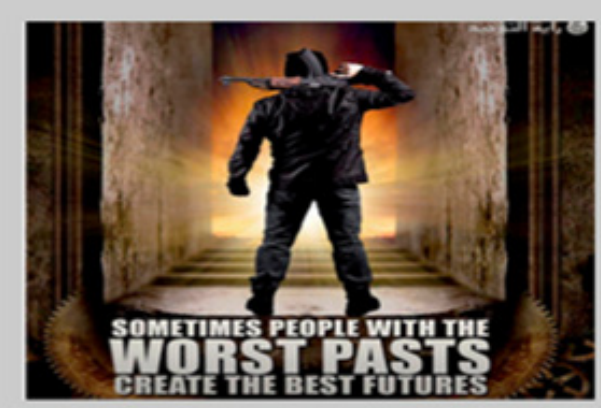
Rumiyah, Issue 11, Al Hayat Media Centeri 2017i pp. 44-52

WARNING: Indicators in and of themselves may be lawful conduct or behavior and constituting rights guaranteed by the US Constitution. Moreover, evaluating totality of behavioral indicators and other relevant circumstances helps ensure no single indicator is used as the basis for action when responding in correctional and other law enforcement settings.