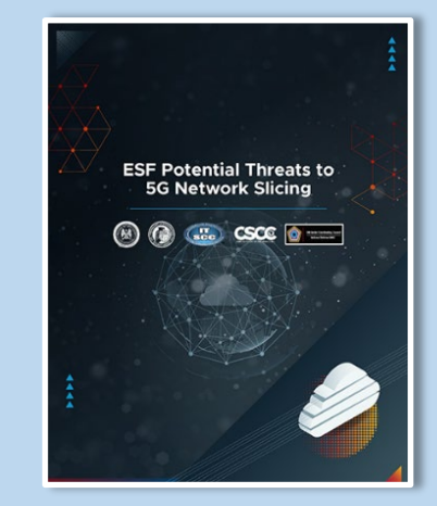
Enduring Security Framework: "Potential Threats to 5G Network Slicing" (2022)

• Adopt Multi-Layered Security to prevent users from